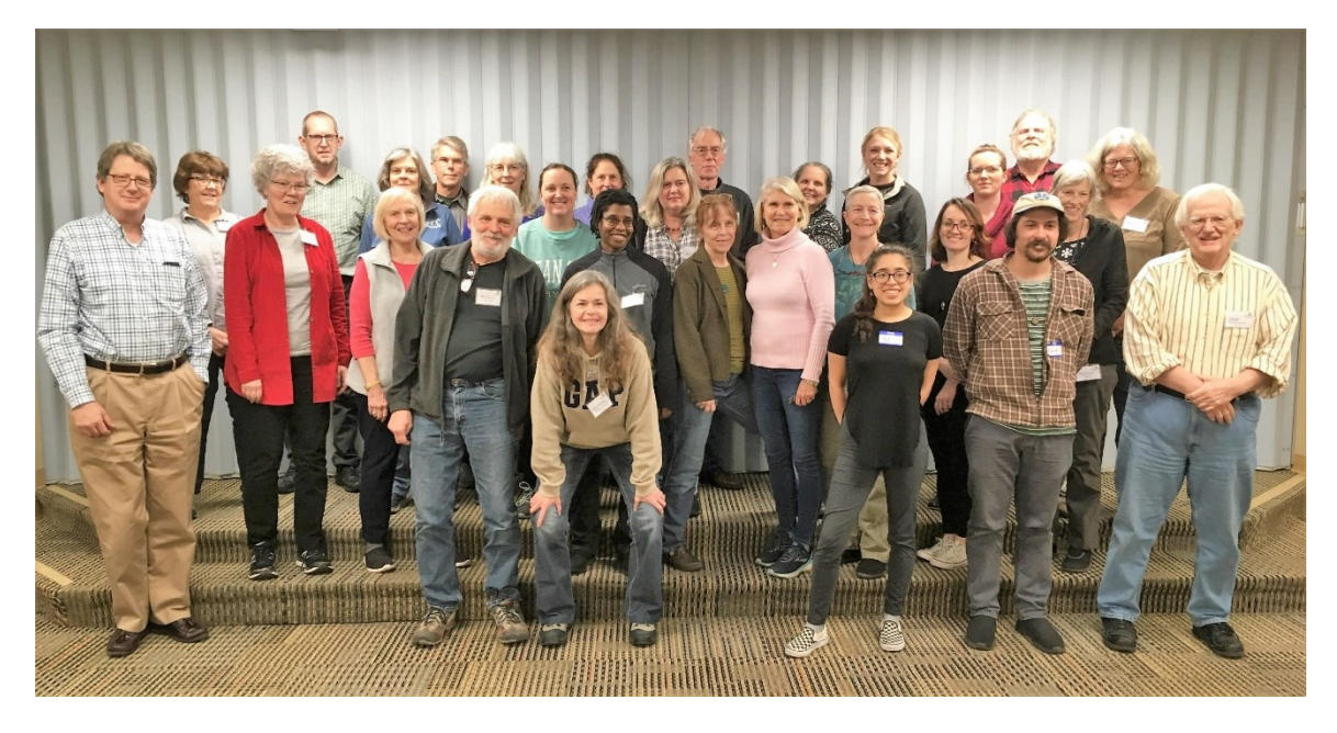
Riverine Training Class

Certified members volunteer a minimum of 40 hours a year on chapter approved projects.