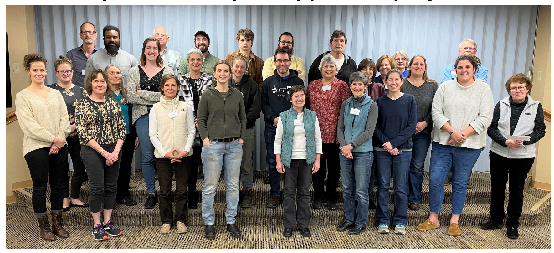
2020 Riverine Training Class

Certified members volunteer a minimum of 40 hours a year on chapter approved projects.